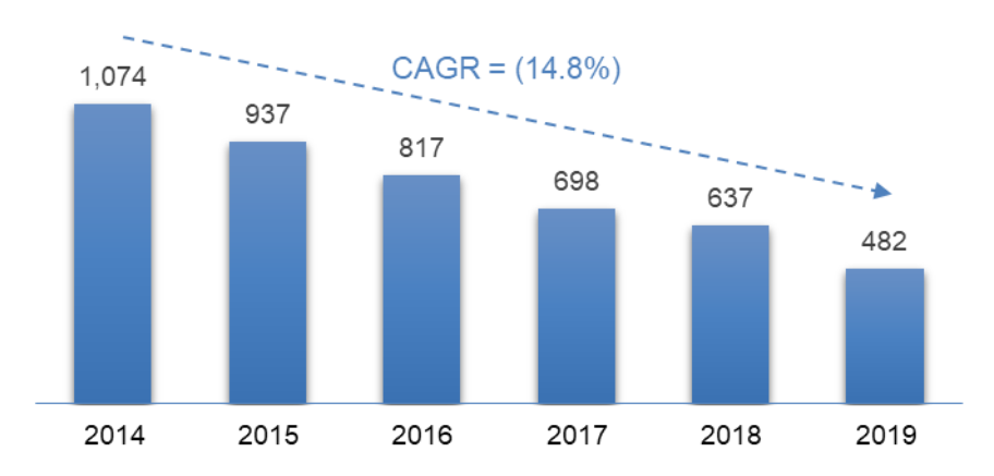
Figure 3: ILD market revenues in Israel, NIS millions1

It is evident that ILD market revenues have been steadily declining in recent years.