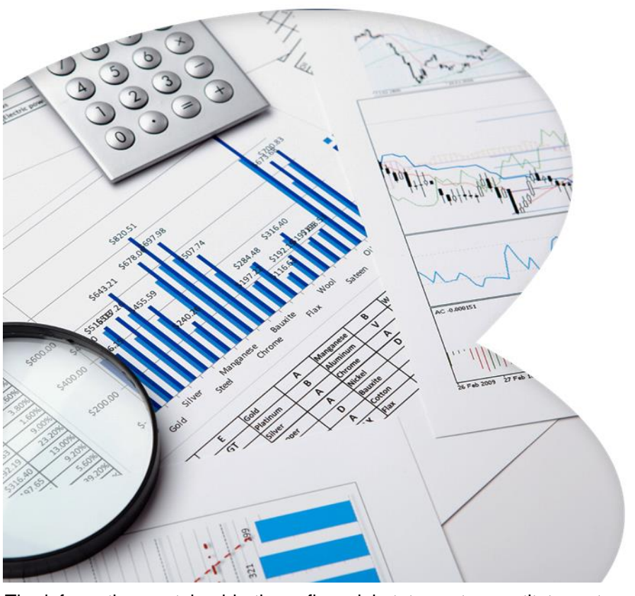
Part C: Condensed Consolidated Interim Financial Statements as at September 30, 2020 (Unaudited)

The information contained in these financial statements constitutes a translation of the financial statements published by the Company. The Hebrew version was submitted by the Company to the relevant authorities pursuant to Israeli law, and represents the binding version and the only one having legal effect. This translation was prepared for convenience purposes only.