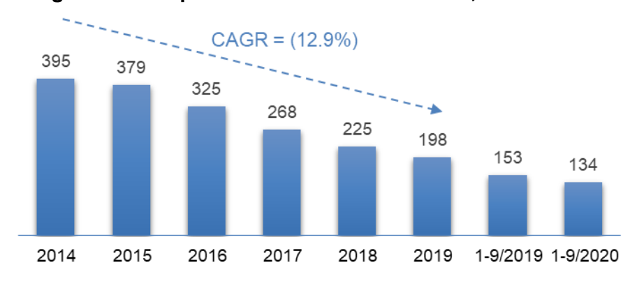
Figure 4: Bezeg International's ILD Revenues, NIS millions<sup>2</sup>

Bezeq International's ILD revenues have been steadily declining in recent years, in line with the general trend in the ILD market, with revenues dropping an average of 12.9% a year during the years 2014 – 2019. The trend continued in the first three quarters of 2020, with revenues down 12.3% compared to the same period last year.